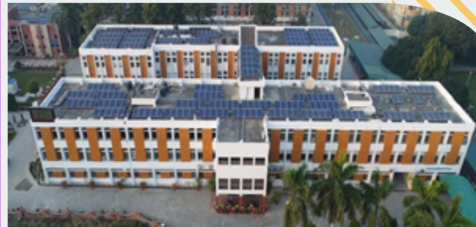
NIH MAIN BUILDING AT ROORKEE

The National Institute of Hydrology (NIH) is a premier Research and Development organization under the Dept. of Water Resources, River Development and Ganga Rejuvenation of the Ministry of Jal Shakti, Government of India. It was established in 1978, with its headquarters at Roorkee. The main objectives of NIH are to undertake, aid, promote and coordinate systematic and scientific work in all aspects of hydrology. The Institute was declared an S&T organization in 1987.